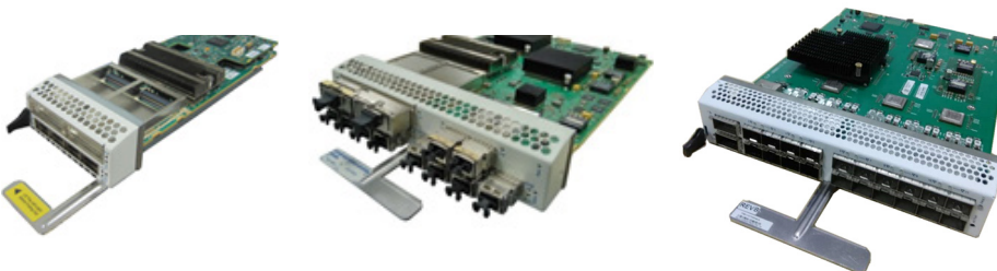
Service Modules: 400G Coherent Module 1 (CHM1/CHM1G), 400G Coherent Module 2 (CHM2), and 20x10G/2x100G Transponder/Muxponder Module (XTM2)

The Groove G30 MUX is based on the innovative three-tier modular architecture of the Groove G30 Network Disaggregation Platform providing a number of competitive advantages to DCI and telecom network planners and architects. Four service slots in the Groove G30 1RU chassis support up to four single-slot sleds/modules or two double-slot sleds/modules that are field replaceable, individually configurable, and hot swappable. Three 400G sleds (or field replaceable units, FRUs) are currently available for MUX applications: two single slot and one dual slot. The single slot 400G Coherent Module 1 (CHM1) and 400G Coherent Module 1G (CHM1G) can be equipped with up to two 200G line side interfaces (CFP2-ACO pluggables) and up to four 100G client side interfaces (QSFP28 pluggables).