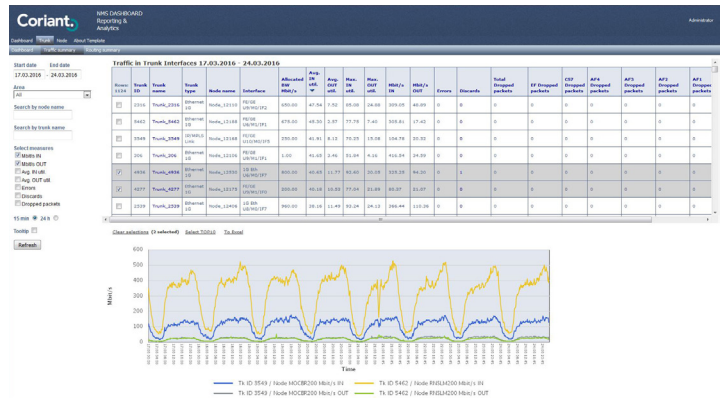
Figure 1: Example of a selected Trunk Traffic view

With an annual subscription, Coriant maintains the entire solution remotely via a secure VPN connection. Installation, upgrades, and maintenance are included in the comprehensive reporting service, as updated NMS and element software release versions are available.